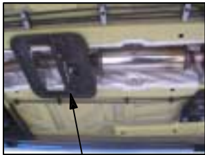
TUNNEL BRACE (TO BE RE-USED)