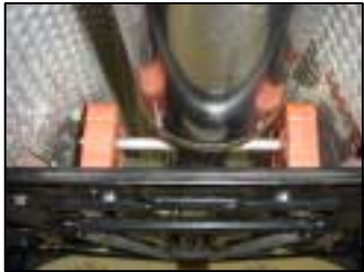
TUNNEL BRACE (TO BE RE-USED)

Warning: When working on, under, or around any vehicle exercise caution. Please allow the vehicle's exhaust system to cool before removal, as exhaust system temperatures may cause severe burns. If working without a lift, always consult vehicle manual for correct lifting specifications. Always wear safety glasses and ensure a safe work area. Serious injury or death could occur if safety measures are not followed.