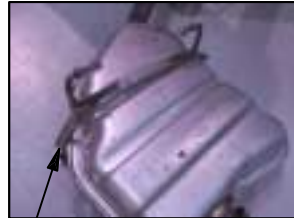
HANGER STRAP (TO BE REMOVED)